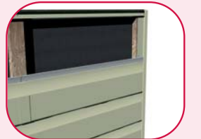
fig 9.3 Showing how the cladding is capped by the U-trim