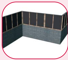
fig 7 Showing moisture barrier and battens before the cladding begins