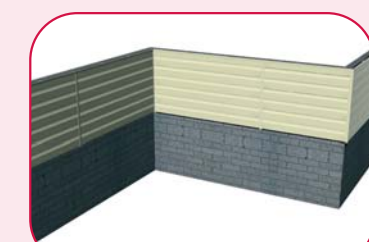
fig 12 Fully clad wall