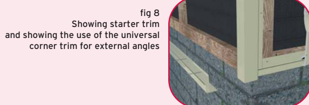
fig 8 Showing starter trim and showing the use of the universal corner trim for external angles