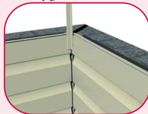
fig 9.2 Showing the male component of 2-part corner trim being applied once cladding is finished