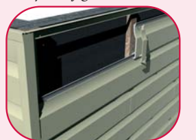
fig 10 Joint detail showing use of FC209 butt joint moulding