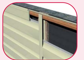
fig 11 Top edge detail showing packing piece and 2-part Universal trim.